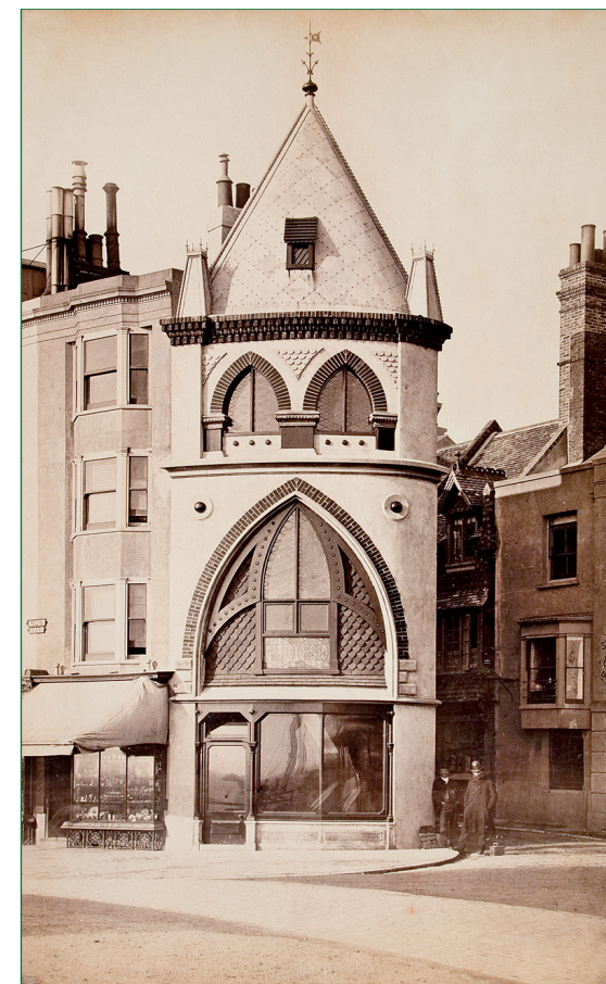
The photographic history of the development of Brighton