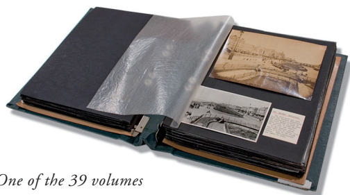
One of the 39 volumes

The collection covers the gamut of Brighton life; interestingly, photography was advancing concurrently with the physical enlargement of the town, and the result is a unique and fascinating view of our past that has dictated our present. The detailed notes that accompany the photographs explain the changes that have taken place.